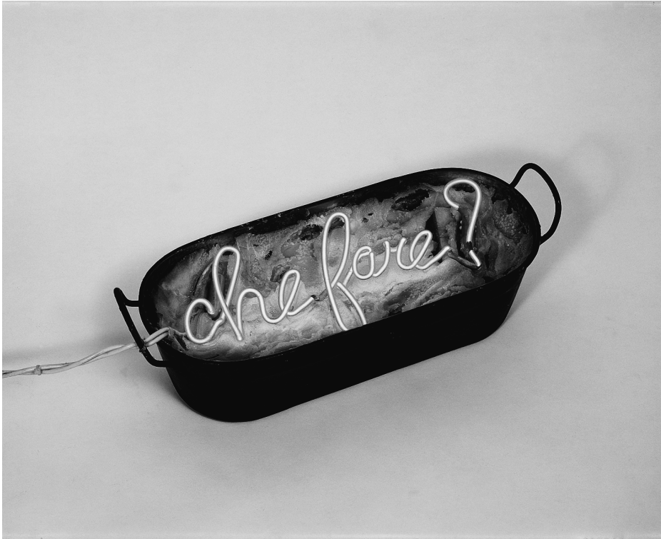
Merz. Che fare? 1968.

we found ourselves in a crossfire; between the students who had nothing whatsoever to do with our claims and with our cultural interests on one side, and the police who wanted to maintain order at all costs, in order to keep Venice from suffering economically on the other. We found ourselves in an ambiguous situation which in no way corresponded to the real needs of the Italian cultural situation. 40