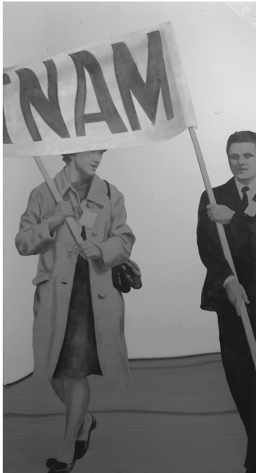
Michelangelo Pistoletto. Vietnam. 1965.