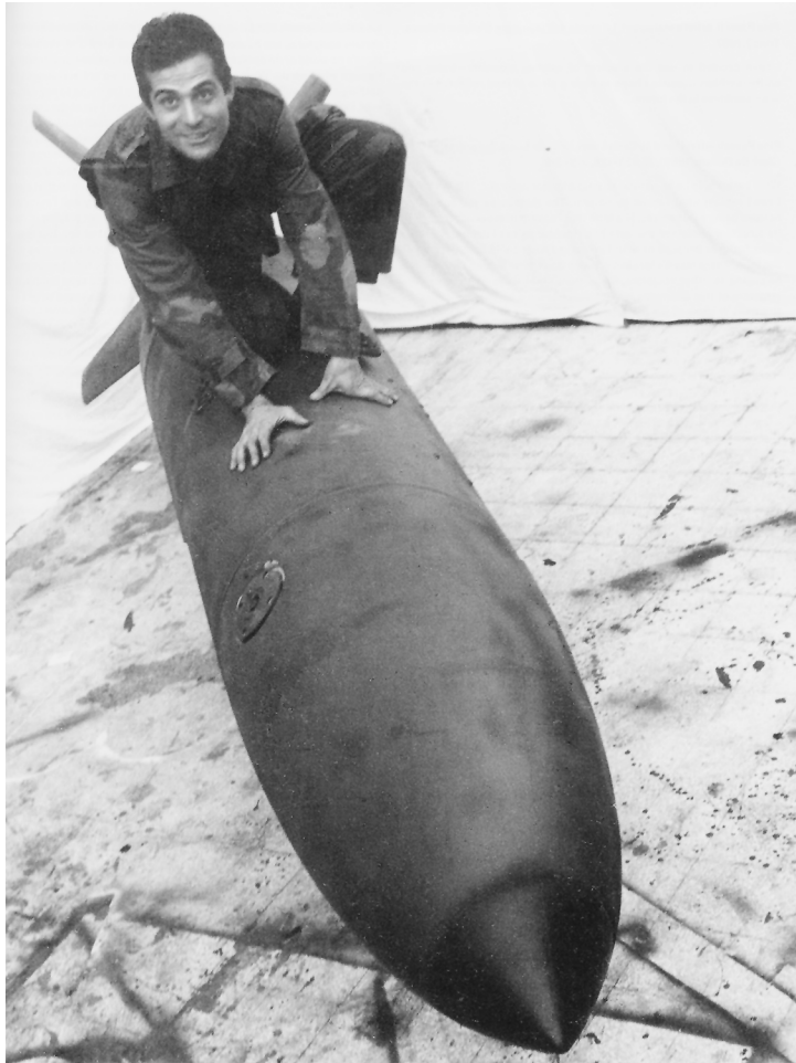
Pino Pascali with Colomba della pace, 1965.