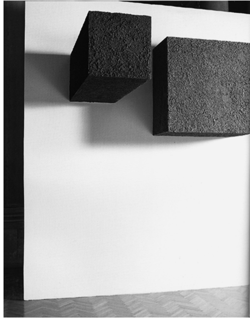
Pascali. Due metri cubi di terra, left, and Un metro cubo di terra, right. 1967.

All these things have shown that we are still at a level of violence, that people think they can impose their moral problems with violence. Physical violence is one thing, intellectual violence is another. Here physical violence was used on both sides. The police were here to avoid physical violence and were involved by a certain kind of provocation. Hence