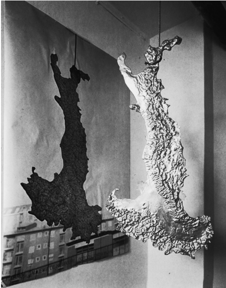
Luciano Fabro. Italia d'oro . 1968–71.

Like Pascali, Fabro arguably drew his political references from memories rather than contemporary polemics. Despite Fabro's reluctance to align himself with the present political struggles of the students, his Italie series, begun in 1968, which examined the notion and character of nationhood, can be read in terms of the country's political past, and, like Pascali's ambivalent weapons, was also subject to censorship. Fabro produced several variations on the theme of Italy strung upside down and suspended by a wire noose, including a cartographic outline of the country in Italia rovesciata (Italy turned upside down, 1968), an iron Italia fascista (Fascist Italy, 1969), and finally, the gilded bronze Italia d'oro (Golden Italy, 1968–71). For Fabro's solo exhibition at the Galleria de Nieubourg in Milan in 1969, a street poster was printed with a reproduction of Italia